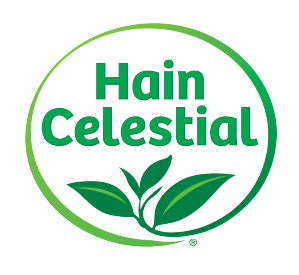
HAIN Celestial Group INC Rank 21 of 37